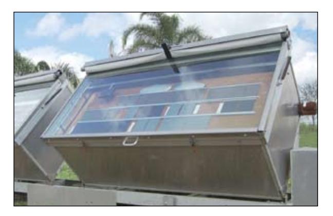
Q-Lab Weathering Research Service offers both typical direct exposure testing and special services. Shown above are AIM (automotive interior materials) boxes, designed to simulate the environment inside an automobile.