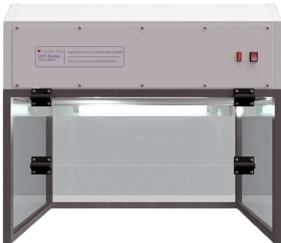
The upper housing

The upper housing contains the mains switch, low-airflow alarm, speed control and carbon filter.