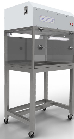
Optional open-base work area